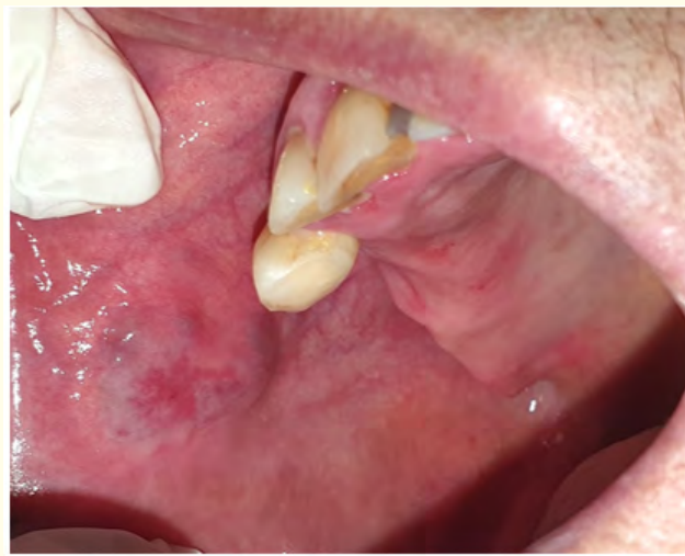
Figure 2: Complete shrinkage of the lesion of case 1.

A 55-year-old female patient in good general health presented with multiple oral vascular lesions causing esthetic and functional discomfort. Clinical examination revealed two small (< 0.3 cm) purplish rounded lesions on the right buccal mucosa and one 0.7 cm oval lesion on the ventral surface of the tongue. All lesions were soft, mobile, painless, and pulsatile, with no lymphadenopathy. Clinical features supported the diagnosis of multiple varices (Figure 2).