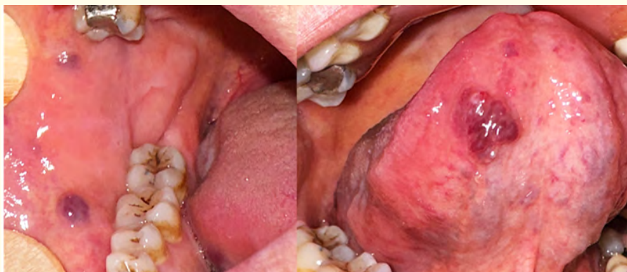
Figure 3: Clinical aspect of the lesion before treatment of case 2.

A 60-year-old patient under follow-up for ductal carcinoma and considered for bisphosphonate therapy presented with a 0.5 cm round, painless, purplish-blue lesion on the left buccal mucosa, evolving for more than five years. The lesion was sessile, soft, slightly pulsatile, and well-defined, with no cervical lymphadenopathy. Diascopy confirmed the diagnosis of an oral varix (Figure 3).