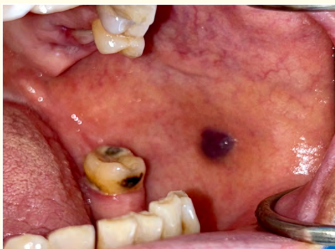
Figure 5: Clinical presentation of the varix of case 3.

At 24 hours, fibrin coating was observed. Complete healing occurred within two weeks. The patient reported no pain or discomfort, and no complications were noted (Figure 5).