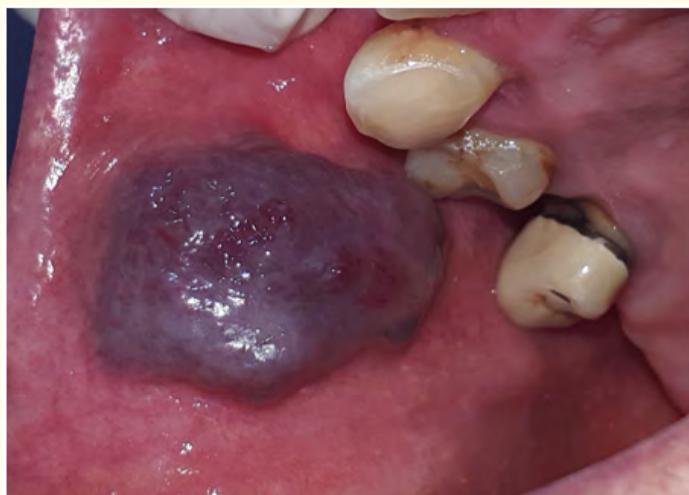
Figure 1: Clinical aspect of the lesion before treatment of case 1.

A 70-year-old female patient with well-controlled hypertension presented with a progressive enlargement of the right buccal mucosa evolving for more than 10 years and causing functional discomfort. Clinical examination revealed a 2.5 cm sessile, purplish-blue lesion with well-defined margins. The lesion was soft, mobile, non-tender, non-indurated, and pulsatile (Figure 1).