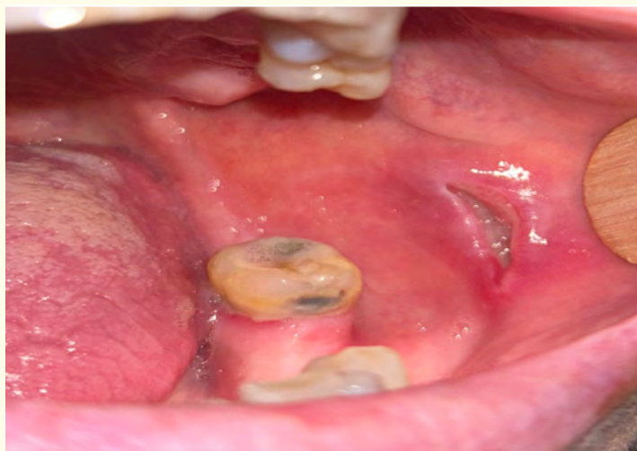
Figure 6: Healing progress at the 2 weeks follow-up of case 3.

At 24 hours, mild discomfort and fibrin formation were observed. At two weeks, lesion shrinkage was noted. Complete healing was achieved at three weeks without complications (Figure 6).