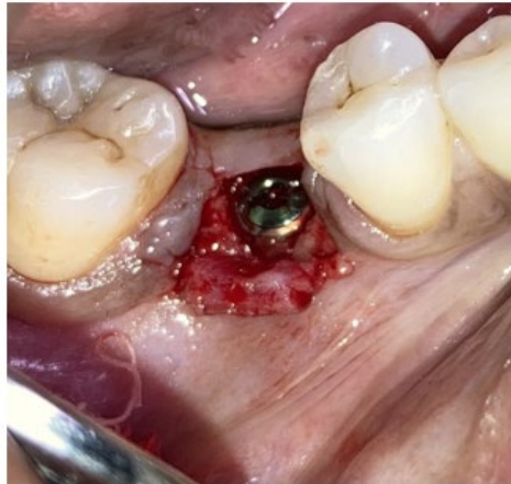
Figure 2: Second stage surgery is performed 3 months after implant placement and buccal rotational flap performed simultaneously with a modified healing abutment with flowable composite. A three-sided flap with a more lingually placed crestal incision and the papillae reserved is created. After de-epithelization with scalpel, two vertical incisions are made to the vestibule so that the flap could be freely rotated.

One of the most important steps is the proper de-epithelialization. So, de-epithelization with done with B.P. blade no 11 and enabling the flap to be rotated inward and was adapted with the keratinized mucosa facing the healing abutment (Figure 2) and simple interrupted suturing was performed to fix the rotated flap buccally against the abutment (Figure 3). The healing abutment was ensured to be kept out of occlusion during centric movement and excursion. After one week, the suture was removed, and the wound healed uneventfully.