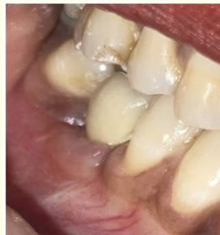
Figure 6: Final prosthesis is placed, and adequate gingival breadth is achieved.