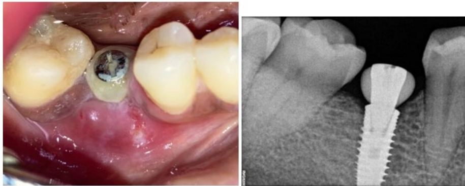
Figure 4: After 10 days, soft tissue healing is evaluated clinically and bone level is evaluated radiographically.

After one month, the treated site was evaluated with complete soft tissue maturation, to reveal an excellent emergence profile (Figure 4). The modified healing abutment was then removed (Figure 5), perfect thick gingival collar was attained and impression coping was screwed into the implant temporarily to make an impression. The permanent crown was placed, excess cement was removed, and occlusion was adjusted. The patient was seen again after 3 months, at which time the papillae were almost filling the interdental space and the scar was faded (Figure 6).