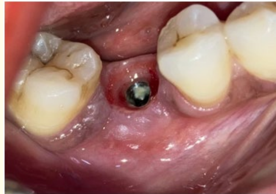
Figure 5: The healing abutment was then removed and perfect thick gingival collar was attained.