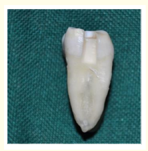
Figure 1: Final specimen.

Rest of the cavity was filled with restorative composite in increments and cured. OPTILUX 400 light (Demetron) with continuous energy mode of polymerization for 40sec was used to cure composite resin increments. Restorations were stored for 1 week at 37°C and 100% relative humidity, Thermocycling was done for 500 cycles at 5°C and 55°C with a dwell time of 15 seconds. The teeth were then painted with 2 coats of nail varnish, except for 1.5 mm beyond the margins of CEJ. Penetration was scored as follows.