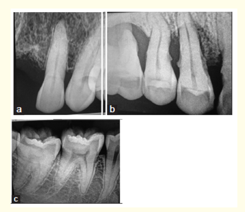
Figure 3: a- Crown root ratio of 1:1 b- CRR of 3:1 - unacceptable for abutment selection c-2:3- most acceptable CRR for abutment selection [17].