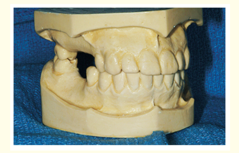
Figure 1: Diagnostic casts for FPD, which helps in the evaluation of the abutment teeth [5].

During the fabrication of diagnostic casts, the orientation of the cast should be kept particularly in mind, mainly the occlusal plane and the transverse hinge axis, which helps in mimicking the eccentric movements of the mouth. The diagnostic cast helps us to evaluate the occlusal relationship of the abutment as well as the dental arches. Another benefit of using the cast is the evaluation of rotated teeth and the malocclusions and their respective effect on the occlusion. The alignment of the abutment teeth and gingival tissues can also be observed and studied with the help of a diagnostic cast (Figure 1) [4,5].