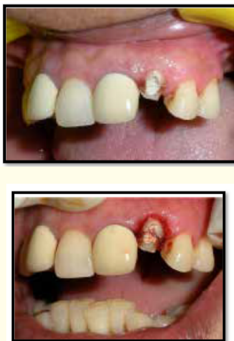
Figure 2: Crown lengthening procedure using external bevel gingivectomy [11].

The soft tissue is excised like in gingivectomy. They can be used in cases where hyperplasia of gingiva or pseudopockets is present. One more prerequisite for this is the presence of adequate keratinized tissue (Figure 2 and 3).