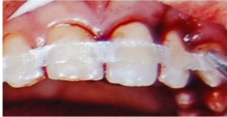
Figure 3: Fiber splinting of teeth done after trauma [16].