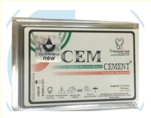
Figure 6: CEM.