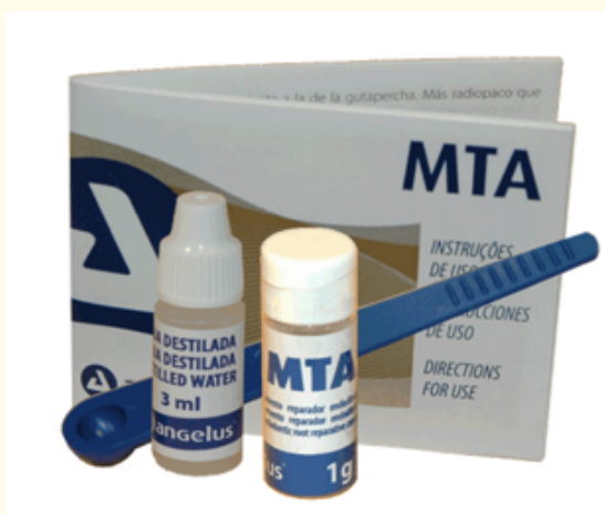
Figure 4: MTA.

As a member of hydraulic calcium silicate cements MTA was introduced by Lee, et al. and patented by Torabinejad in 1995 [9]. It is composed of tricalcium silicate, bismuth oxide, tetra calcium alumina ferrite and calcium sulphates dehydrate. When MTA is mixed with water a colloidal gel with a pH of 12.5 similar to that of calcium hydroxide. MTA in contact with pulp tissue promotes dentinal bridge formation. In a study done by R Caicedo (2008), the author conclude that the responses of pulps in primary teeth to MTA pulpotomies and capping were favourable and that MTA can be used as Direct Pulp Capping material [10]. The disadvantages of MTA are its long setting time and its price.