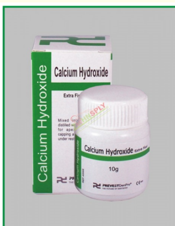
Figure 3: Calcium hydroxide.