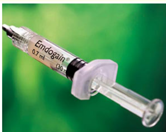
Figure 8: EMD.