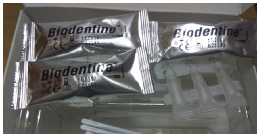
Figure 5: Biodentine.

Biodentine (Septodont Ltd., Saint Maur des Fausses, France) is a new tricalcium silicate ( \text{CaSiO}_3 ) based inorganic restorative commercial cement and advertised as “Bioactive dentin substitute”. Biodentine is a powder-liquid system where the powder is composed of tricalcium silicate, calcium carbonate, zirconium oxide, calcium oxide, dicalcium silicate, and iron oxide. The liquid is a solution of a hydro-soluble polymer with calcium chloride. Biodentine has better handling and physical properties than MTA. In studies done by Shayegan in primary pig teeth, Biodentine was found to be a suitable material for pulpotomy and DPC.