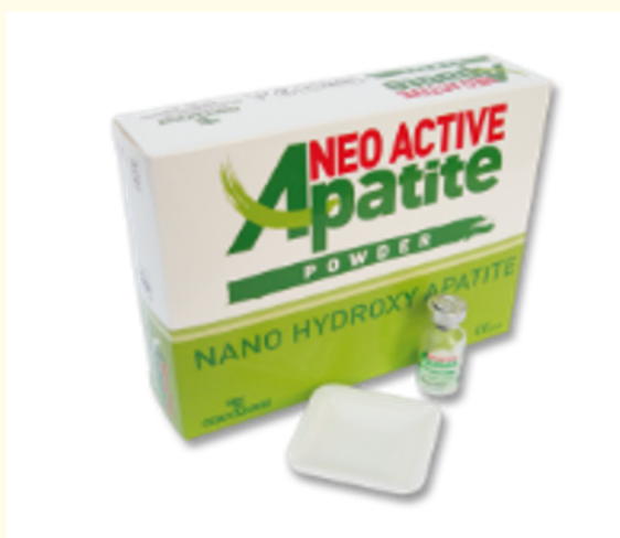
Figure 7: NHA.

Hydroxyapatite has already been used in bone grafts in orthopaedic and dental applications due to its structural similarity to bone and teeth. Recently a fully synthetic nanocrystalline hydroxyapatite (NHA) paste containing approximately 65% water and 35 and apatite particles has been introduced. The advantage of this material is its close contact with surrounding tissue and the presence of high number of molecules on its surface due to its nanocrystalline structure. The biocompatibility of NHA, combined with its structural similarity to teeth allows NHA to stimulate odontoblast thus promoting the formation of dentinal bridge. Shayegan (2010) in a study found NHA to be biocompatible and observed that it provoked mild inflammatory reaction in pulp tissue when used in pulpotomies and pulp capping. Haghghoo R, et al. (2015) in a randomized trial comparing the histological effects of CEM and NHA cements when used as pulp capping material found CEM to be superior to NHA in rate of tertiary dentin formation and also in pulpal inflammation.