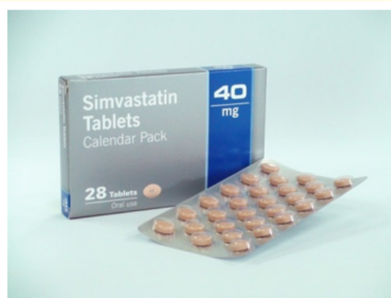
Figure 9: Simvastatin.

Statins are structural analogs of HMG-CoA- (3-hydroxyl-3-methylglutaryl-CoenzymeA). These drugs are the first line for hyperlipidemia. Statin has multiple functions, including anti inflammation, induction of angiogenesis and bone formation. Simvastatin has anabolic effects on bone metabolism they promote mineralization in non-mineralizing osteoblasts through induction of BMP-2 and osteocalcin.