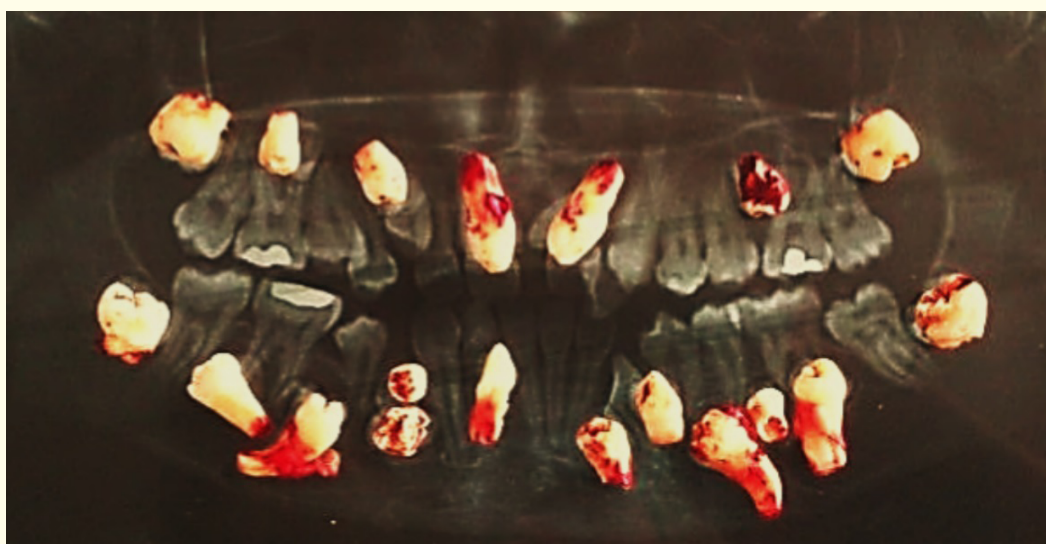
Figure 4: Case 2. Extracted STs and impacted teeth over the radiograph after surgical removal.