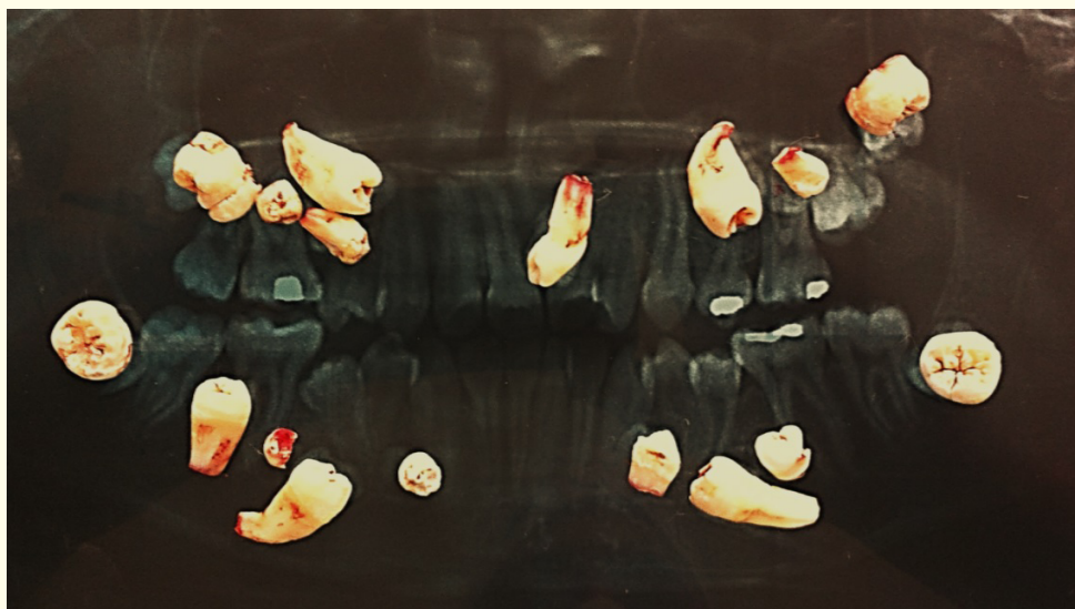
Figure 3: Case 1. Extracted STs and impacted teeth over the radiograph after surgical removal.

Patients were referred to the Department of Genetics to rule out a syndromic condition. The geneticist confirmed that the 14-year-old twin brothers were not syndromic. The parents of the both patients were informed of the presence of these STs and given the pros of surgical removal versus leaving them in position. They opted for surgical removal of STs and impacted teeth. One month later, after informed consent and with patients under general anesthesia, supernumerary and impacted teeth were removed using buccal, palatal and lingual flaps with bone was removed using a 702 low-speed bur (Figures 3 and 4). A 1-year-follow-up shows no signs of paresthesia, excellent bone healing, and adequate local conditions for orthodontic alignment (Figures 5 and 6).