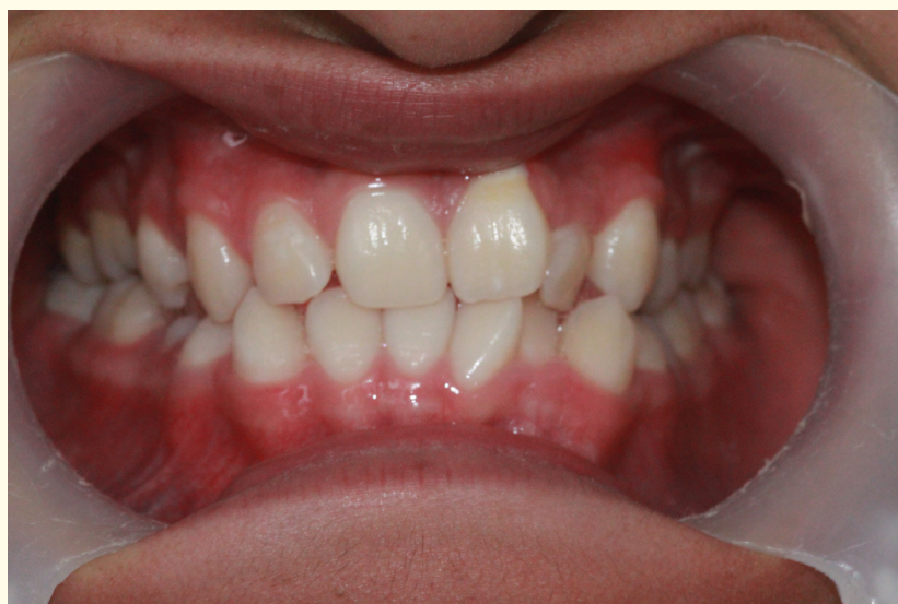
Figure 6: Case 2. Clinical appearance after 1-year follow-up.