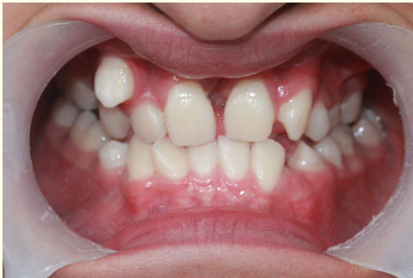
Figure 5: Case 1. Clinical appearance after 1-year follow-up.