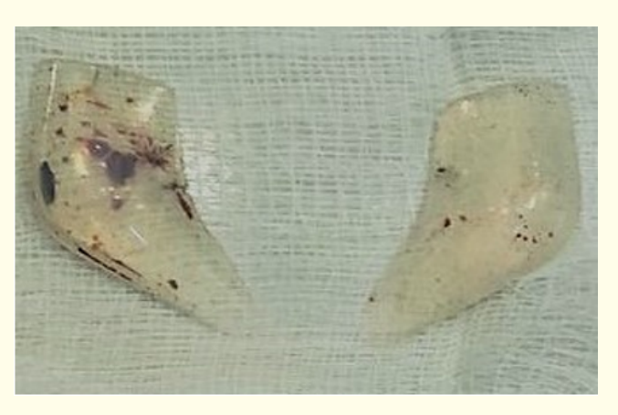
Figure 2: Rubber silicone after removal.

Straight incision has been made over the external oblique ridge almost on the same previous incision then exposing the lateral side of the ramus. Screws that used for stabilizing the implants were removed carefully using screw driver and mosquito after that both implants have been removed figure 2. Pressure-irrigation done using large syringe filled with normal saline mixed with gentamycin. 3.0 absorbable vicryl suture used for closure. Two weeks later, patient showed absence of any kind of discomfort compared to the pain that felt before operation.