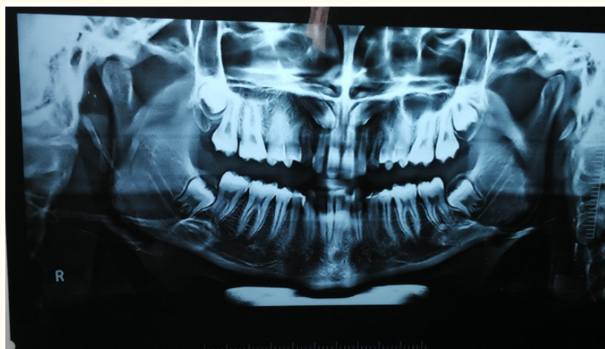
Figure 1: Orthopantomogram revealing the presence of impacted bilateral permanent canines.

A 17 years old female patient visited our institute with the chief complaint of pain in the upper front teeth region of jaw since 1 month. On clinical examination, deciduous canines were seen in the maxillary arch and both maxillary permanent canines were absent. Hence, orthopantomogram was advised. Radiographic examination revealed the presence of impacted maxillary permanent canines as shown in figure 1.