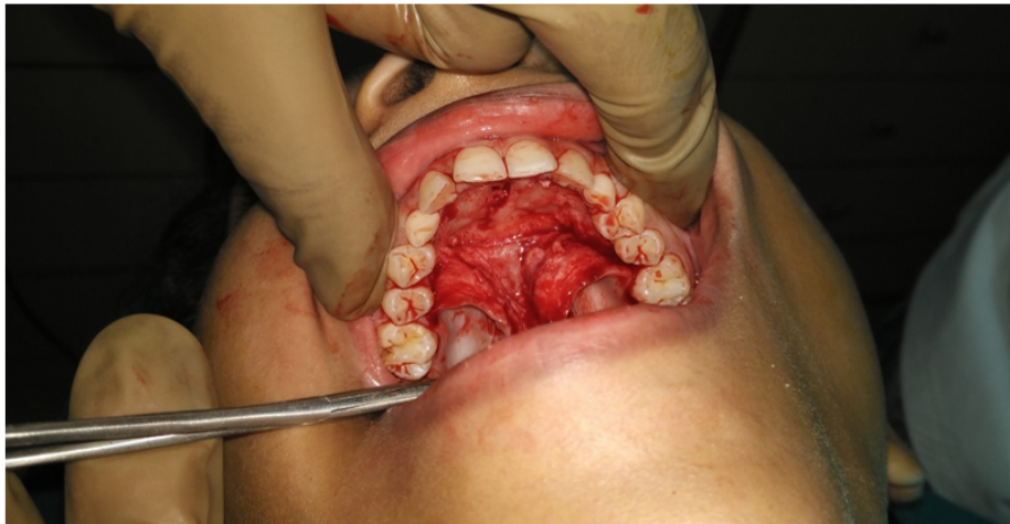
Figure 2: Surgical exposure of the site to be operated.

Bilateral infraorbital nerve block was administered. Palatally, local anaesthetic infiltration was administered. Crevicular incision was given from distal side of maxillary right second premolar to the distal side of maxillary left second premolar. Mucoperiosteal flap was elevated with periosteal elevator. Figure 2 reveals the surgical exposure of the site. Bilateral impacted canines were located as shown in the figure 3 and was extracted with the help of elevators and extraction forceps.