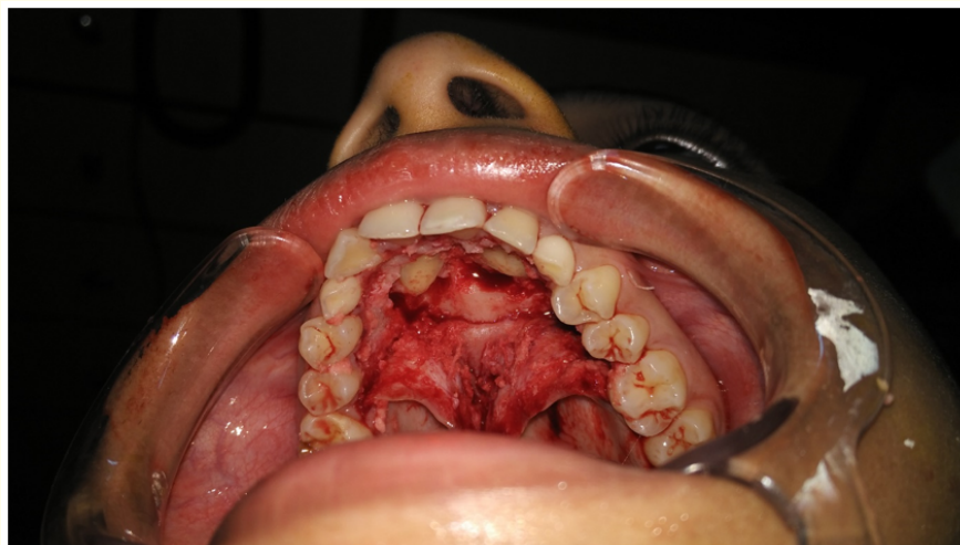
Figure 3: Bilateral impacted permanent canines located.