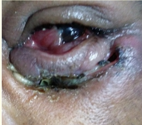
Figure 1: Extraoral photograph showing swelling in the left infraorbital region with maggots coming out of the sinus opening.

A 40-year-old male patient was reported to the private Dental Clinic with a chief complaint of “bugs coming out near the left eye region and running nose” since past 4 - 5 days (Figure 1). The patient underwent extraction of left maxillary teeth one year ago. He is from a low socioeconomic background, malnourished, and had poor oral hygiene with severe halitosis. Medical history revealed that the patient was diabetic, and he had a deleterious habit of alcohol consumption since 10 - 15 years. The patient was febrile with a body temperature of 101°F.