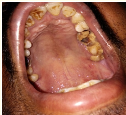
Figure 2: Intraoral examination showing oro-antral communication in the left maxillary region.

There was a sinus opening in the left infra-orbital region with inflamed surrounding conjunctiva. Maggots were seen coming out of the sinus opening. Oro-antral communication is seen in the left maxillary region around the region of the second premolar and first molar (Figure 2). The surrounding area was swollen and erythematous. The alveolar bone in area 25 and 26 is denuded and necrotic with persistent pus discharge.