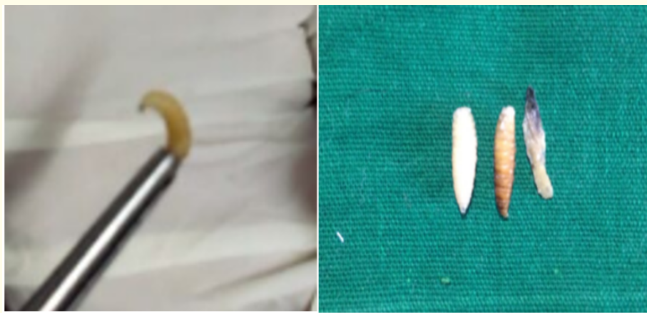
Figure 4: Larvae collected from the location of the lesion.

Maggots were manually removed under local anesthesia prior to surgery by “occlusion or suffocation” method using turpentine oil. Cotton ball impregnated with the oil were placed within the sinus opening and intra-orally in the oro-antral communication. The larvae started coming out near the surface in search of air and then were removed (Figure 4). Later the larvae were sent to the department of parasitology for entomological examination, and the reports revealed that the larvae belonged to “Chrysomya bezziana” group which are predominantly found in the Indian subcontinent. Subsequent surgical management includes extraction of periodontally weakened teeth, debridement of necrotic bone and infected soft tissue. After extensive wound irrigation with saline solution and metronidazole, turpentine oil was applied to remove any remaining larvae. Hydrogen peroxide was applied over the wound to induce bleeding and subsequent healing. Lastly, wound closure was done in layers. The intra oral wound is left with an antibiotic soaked gauze pack. The patient was advised with a high protein diet and prescribed with Ivermectin 6mg orally for 15 days and Ceftriaxone 2 gm per day for 1 week.