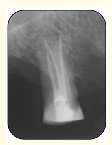
Figure 3: Immediate postoperative radiograph.

During the second visit after application of rubber dam, intra canal dressing was removed and all the three canals were irrigated with 5.25% sodium hypochlorite and dried with sterile paper points (Meta Biomed Co. Ltd, Korea). All the 3 canals were obturated with lateral condensation technique using gutta percha points (Meta Biomed Co. Ltd, Korea) and AH plus sealer (Dentsply, Germany) (Figure 3). Access opening was closed with glass ionomer restoration (GC Fuji IX, GC Corporation, Japan) and postoperative radiograph was taken.