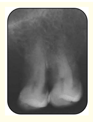
Figure 1: Preoperative radiograph.

A 63 years old male patient was referred to the Endodontic division at Batterjee Medical College from Removable Prosthetic division for intentional root canal therapy of maxillary right second premolar for overdenture. During the objective examination there was no specific finding. Radiographic examination revealed bone loss, but with no periapical pathosis (Figure 1).