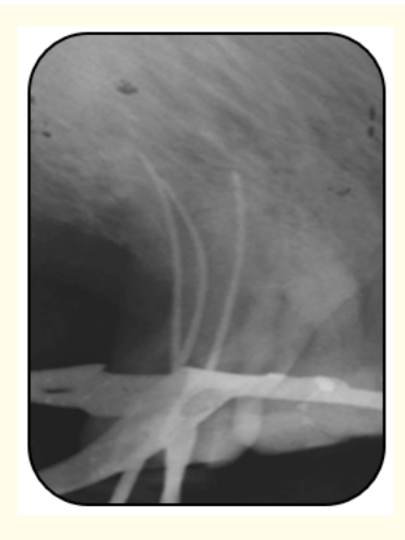
Figure 2: Working length radiograph.

After infiltration with local anesthetic (4% articaine with 1:100,000 epinephrine) (Septodont, France), the tooth was isolated using rubber dam. The access cavity was prepared with Endo Access bur (Dentsply Maillefer, Switzerland) and Endo-Z bur (Dentsply Maillefer, Switzerland). Three canal orifices were located mesiobuccal (MB), distobuccal (DB) and palatal (P). The MB and DB canal are joining in apical 3<sup>rd</sup>. The pulp tissue was extirpated using barbed broaches (Dentsply Maillefer, Switzerland) and working length was determined using the apex locator (Dentaport ZX, J. Morita, Japan) and periapical radiograph (Figure 2).