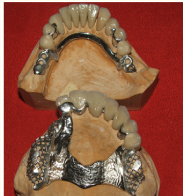
Figure 8: FPD and RPD fabricated and prepared for determination of intermaxillary relations (centric relation). The FPD block and right upper second incisor is a facet crown made of Vita 95, and left upper second premolar was made of Artglass.