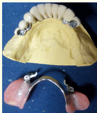
Figure 10: Another successful planning and designing of complex RPD with FPD block construction and Ceramko facets (right lower first premolar and Ceramko facet in the region of left lower first molar).