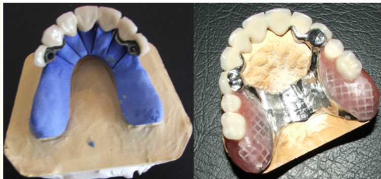
Figure 7: A fixed partial denture made of Ivoclar InLine ceramic and ceramic facets from the same material in the position of right upper first premolar and left upper canine: Kennedy Class 1 partial edentulism before and after RPD fabrication.