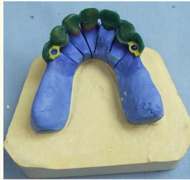
Figure 2: A modeling of fixed prosthesis in wax with CEKA classic resilient – M3OL694-RPR attachment placed in dental paralelometer.