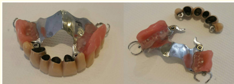
Figure 9: The complex removable partial denture with Ceramko porcelain fused to metal (left). The separated segment of complex RPD for better explanation of attachment system and Ceramko facets (right).