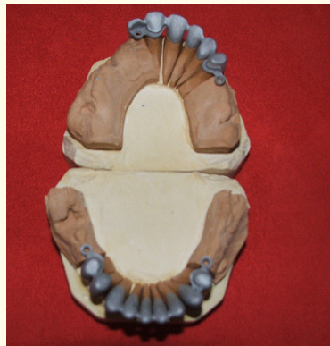
Figure 6: The cast models obtained using Nickle Chrom alloy for porcelain to metal restorations I-Bond 02 Interdent.