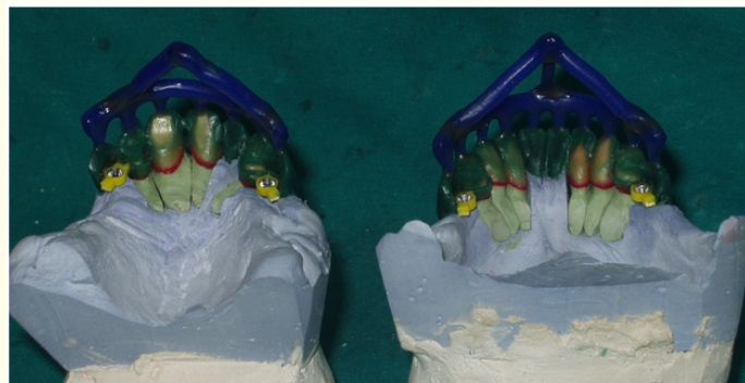
Figure 4: The preparation of wax-models for casting in the Rotax machine.