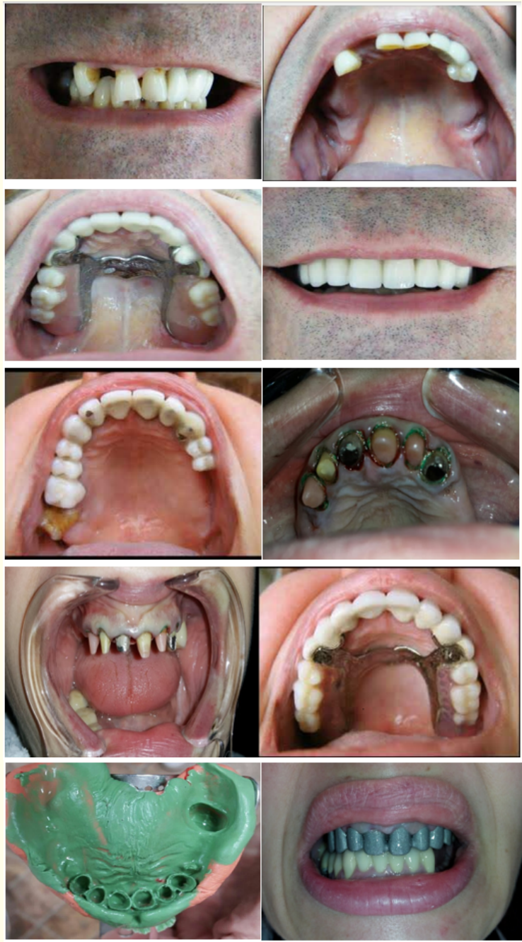
Figure 1: A collage of clinical phases conducted in this study.