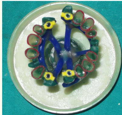
Figure 5: The wax models prepared for casting and placed on the conus.