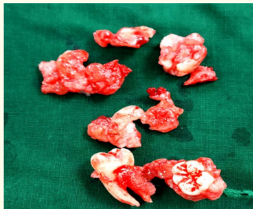
Figure 1D: Enucleated specimen.