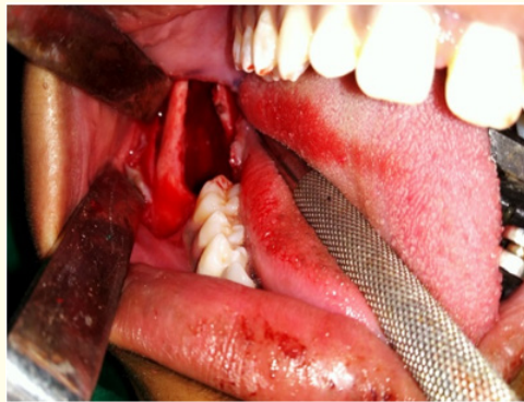
Figure 1C: Intra-oral exposure of cystic lesion.