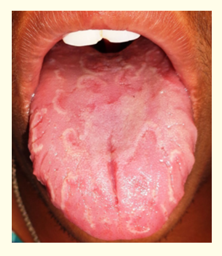
Figure 2: Image showing prominent and characteristic geographic tongue in a 27- years old male patient.

Study conducted by Aboyans V., et al. [14] on 4009 patients and concluded that there was an significant association between geographic tongue and fissured tongue (Figure 2) and a genetic linkage between the two conditions in males has been suggested. Even in our study there was a strong association between these two in 86.9% (n = 206) of patients. The majority of our study patients [80.2% (n = 190) were asymptomatic; interestingly, only 19.8% (n = 47) of patients were symptomatic and this finding is consistent with the reports of other investigators. However, some of our patients reported with range of symptoms that includes glossopyrosis, glossodynia, and altered taste sensation. Regezi., et al. confirmed that these symptoms might be more frequent when fissures were present and infected with candida organisms that might be the reason for these symptoms in our present study also. Regarding the awareness of this enigmatic oral lesion in our present study, only 27% of patients were conscious about the condition and rest 73% were not aware of the presence of this condition.