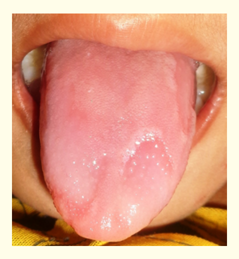
Figure 1: Geographic tongue in a 4-years old boy. The lesion manifest as multiple erythematosus patches bounded by raised white circinate bands.

Eidelman, et al. reported the prevalence of geographic tongue in parent and sibling combinations was significantly higher than in the general population and concluded it was familial and that heredity plays a significant etiologic role [4]. An association between geographic tongue and fissured tongue has been documented [5] and a genetic linkage between the two conditions in males has been suggested. The same genes may be responsible for both conditions [6]. Geographic tongue could arise at any age with no obvious racial predilection, but according to some investigators, the condition is more widespread in younger individuals, however, others have found the majority of the cases are noted in patients over 40 years of age [7-11], as in our study the mean age was 37 years, except in one case it was found in a 4 years old boy which was prominent and characteristic (Figure 1). The gender of affected individuals varies with different studies and it was noted more in women than in men [12] which was the similar finding in our study, that is 61.6% (n = 146) in females and 38.4% (n = 91) in males.