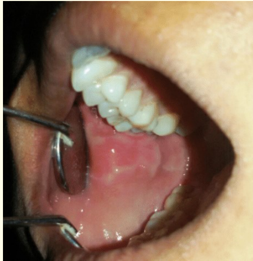
Figure 2: Irregular surface with normal surrounding area.