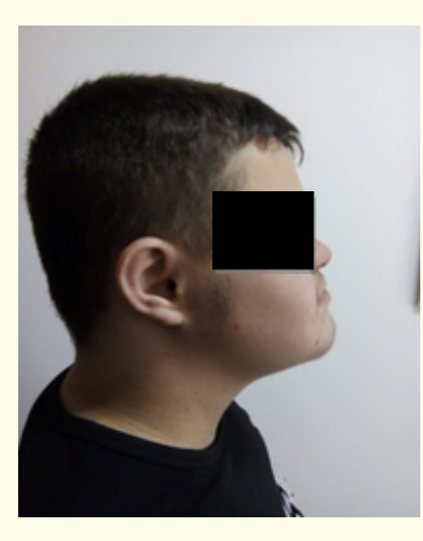
Right profile view