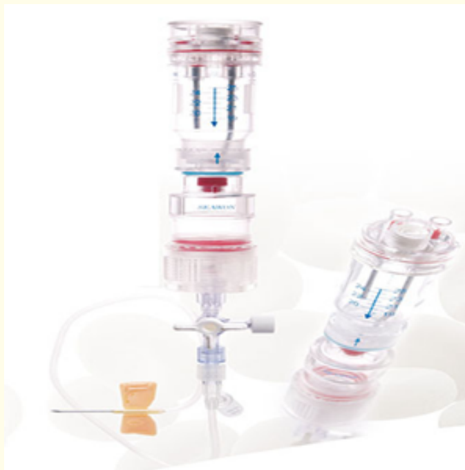
Figure 2: Example of obtaining platelet-rich plasma by closed technique.