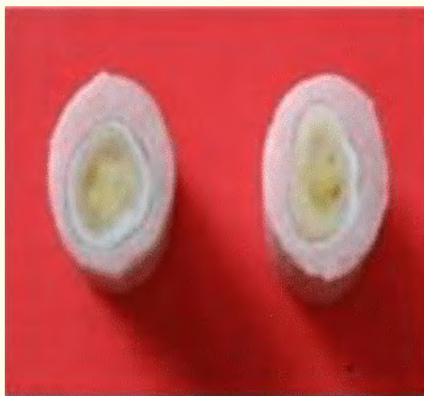
Figure 1: Prepared specimens.

Each tooth was then embedded in a cylinder 15 mm diameter and 20 mm height filled with self-cured acrylic resin (Pattern Bright: Yamaha chi Dental MFG., CO. Japan) till the level of the cervical line. The cut dentin surface was then finished using 600, 400,320, and 240 and -grit silicon carbide papers (Shofu SF 201 Ra): Shofu Inc, Kyoto, Japan) at low speed. The prepared samples were then placed in distilled water for one day before adhesion of resin composite (Figure 1).