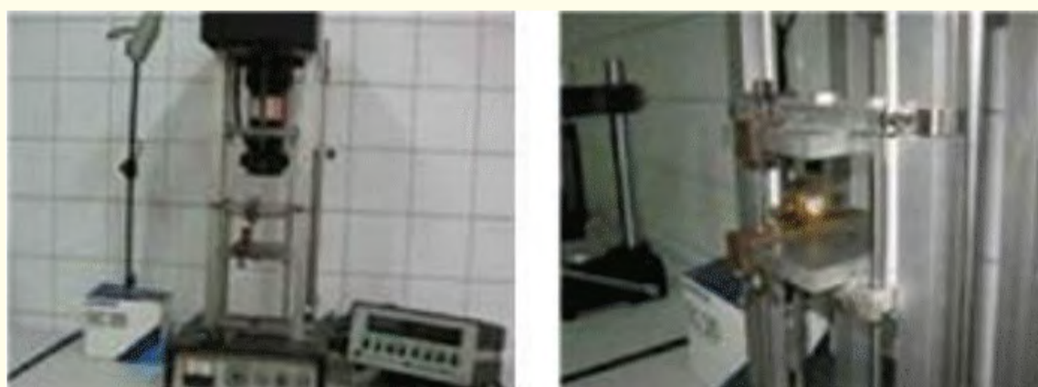
Figure 3: Universal instrument testing machine (A, B).

The samples were mounted on a universal testing machine (Model 8500 Plus Dynamic Testing System-1341 Instron– Instron Corporation) as seen in Figure 3 A and B for testing with the long axis of the specimen being perpendicular to the direction of the applied force. The circular knife-edge was located at the interface between the composite cylinder and the dentin surface. Bond strength was measured in the shear mode at a cross-head speed of 0.5 mm/min until failure occurred.