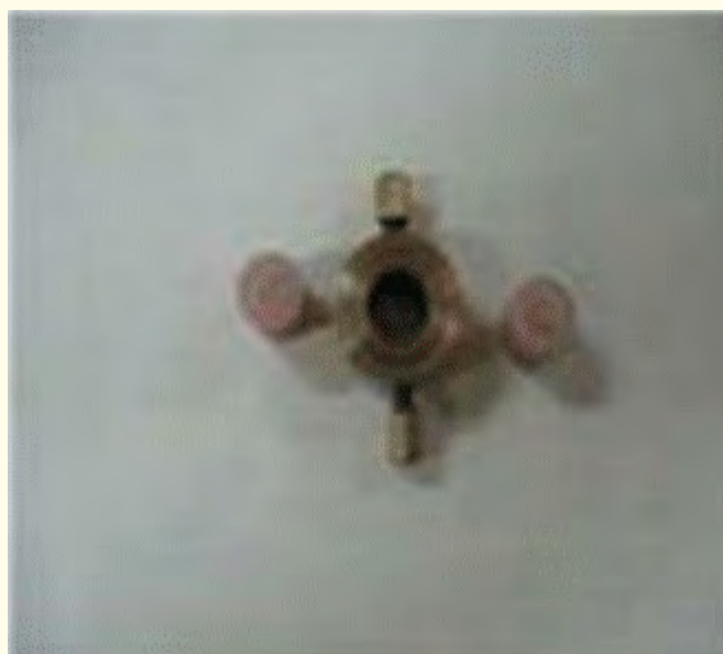
Figure 2: Copper mold.

the same device for 40 seconds to form a composite cylinder. The prepared samples were then thermocycled between 5 C and 55 C water baths for 2500 cycles with a 30-s dwell time, and a 10-s transfer time prior to bond strength testing.