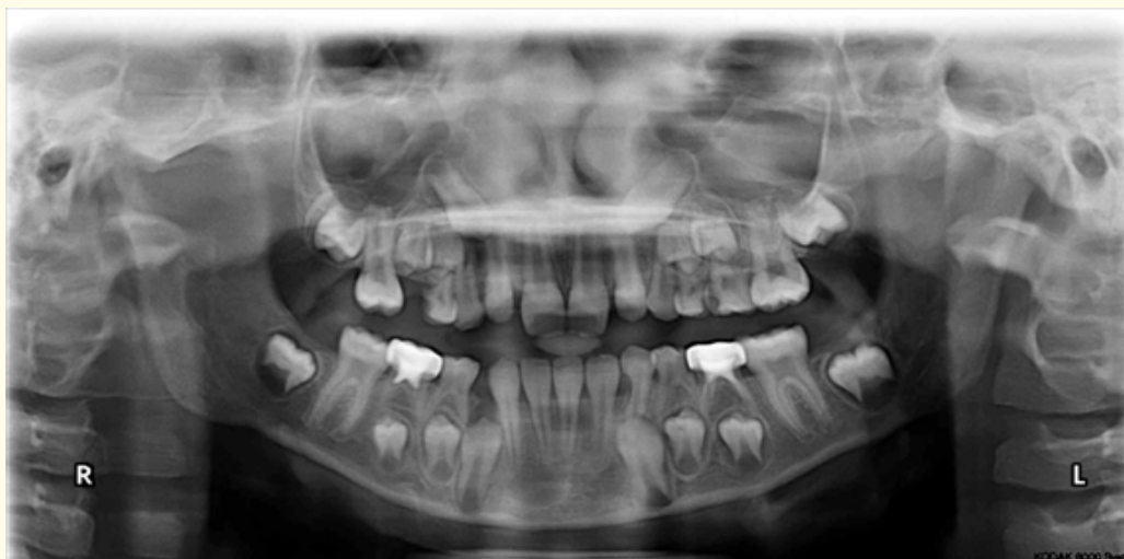
Figure 3: OPG of an 8-year-old patient showing both maxillary permanent canines approaching the midline of the permanent lateral incisor roots. This patient would benefit from extraction of the primary canine.

Most of the records examined in this study came from patients who had been treated by undergraduate students (59.4%); the remainder had been treated by postgraduate students (40.6%). This reflects the nature of the dental school structure, where undergraduates typically comprise 80% of the school's capacity.