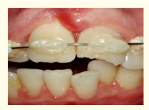
Figure 18: Flexible splint: wire 0.4 and resin composite (4weeks).

After 2 weeks, the root canal treated was performed in 11, 21 using rotary instruments [ProTaper Universal, Dentsply Maillefer, Ballaigues, Switzerland] and filled with hydroxide calcium. Definitive obturation and splint remove were done after 4 weeks (Figure 19). The teeth were then restored with resin composite. Referring to the IADT reassessment protocol followed with revisions at 6-8 weeks, 6 months with radiological (Figure 20) and clinical control (Figure 21) showing a marginal bone loss.