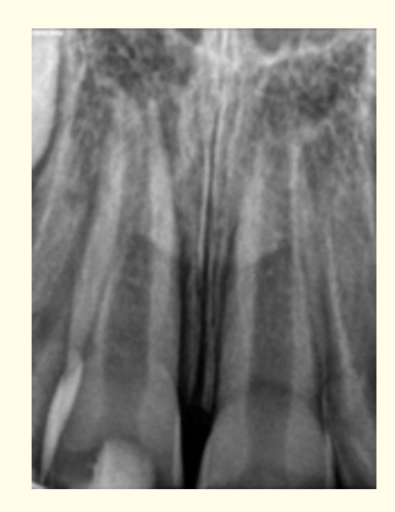
Figure 12: Radiological control after 4 weeks: no signs of pulp complications.