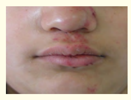
Figure 1: Bruising of the lips.

A 12 years old female consult our department of dental medicine 24 h after a road traffic accident. The exobuccal examination show bruising of her upper and lower lips (Figure 1).