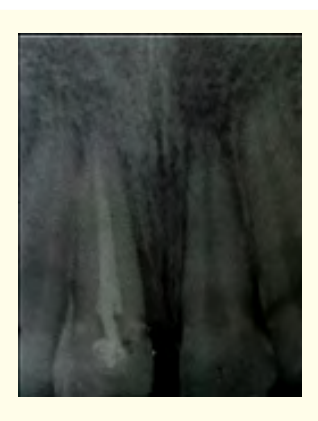
Figure 5: Endodontic obturation after4 weeks.

Endodontic treatment was done 2 weeks later and root canal was filled with hydroxide calcium during 14days followed by gutta percka filling (Figure 5).