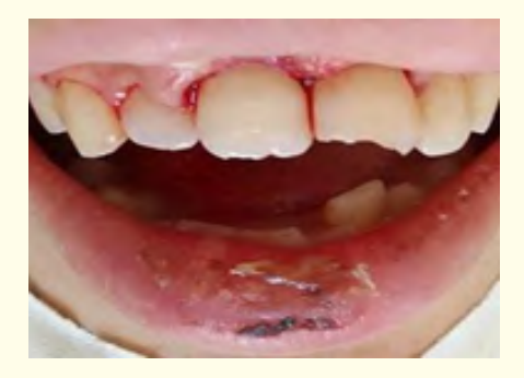
Figure 16: Repositioning tooth 11-21.

Following IADT protocol, we can choose orthodontic or surgical repositioning we opt the second alternative which is less time consuming treatment suitable for our patient, the emergency treatment consisted, under local anesthesia on repositioning the intruded teeth with forceps (Figure 16) followed by radiological control (Figure 17) and flexible splinting using 0.5 diameter Steel wire with composite resin (Figure 18).