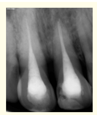
Figure 19: Endodontic obturation (4weeks).

After 2 weeks, the root canal treated was performed in 11, 21 using rotary instruments [ProTaper Universal, Dentsply Maillefer, Ballaigues, Switzerland] and filled with hydroxide calcium. Definitive obturation and splint remove were done after 4 weeks (Figure 19). The teeth were then restored with resin composite. Referring to the IADT reassessment protocol followed with revisions at 6-8 weeks, 6 months with radiological (Figure 20) and clinical control (Figure 21) showing a marginal bone loss.