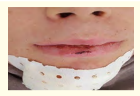
Figure 13: Exobuccal examination Bruising of the lips, sutured wound on the chin.

Extra-orally, we note a bruising of the lower lip, and sutured wound on her chin (Figure 13).