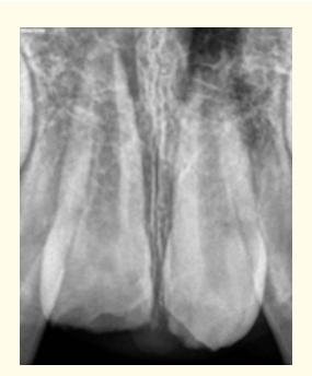
Figure 8: Radiological examination: 11,21: Open root apex (stage 8 of Nolla).

A periapical radiograph was taken showing an immature permanent teeth of both intruded incisors (only stage 8 of Nolla) (Figure 8).