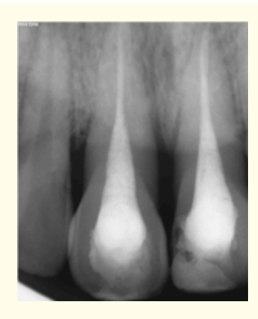
Figure 20: Radiological control after 6 months (no signs of resorption or ankylosis).