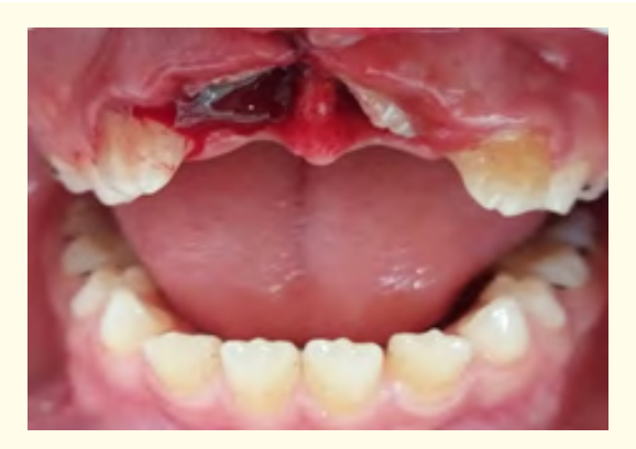
Figure 7a: Intraoral examination vestibular vue 11: total intrusion, 21: severe Intrusion.

A 9 years old male who is victim of Scholar accident consult us 3hours after the injury (during an acute phase). The endobuccal examination reveal a total intrusion of tooth 11 and severe intrusion of tooth 21 (Figure 7).