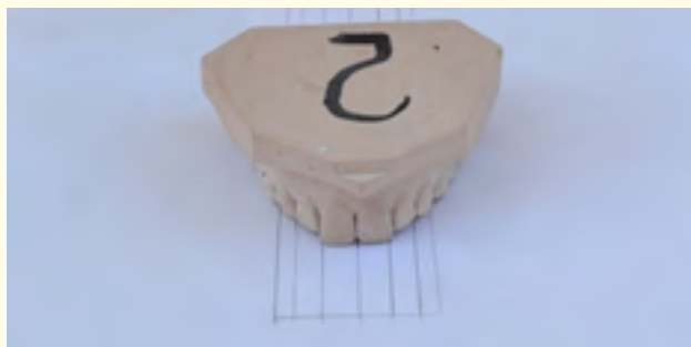
Figure 1: Levin grid on white card of upper cast.

The apparent width (mm) of each upper anterior tooth, as seen in a frontal view [29] was measured, using dividers and a millimeter rule, from a Levin's grid drawn on blank card.