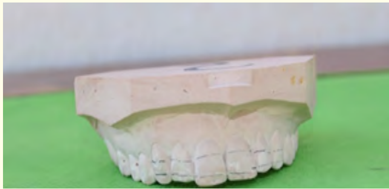
Figure 2: Upper cast with apparent contact dimensions marked in pencil.