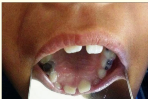
Figure 1: Intraoral examination of patient reveal deep carious lesion # 54.