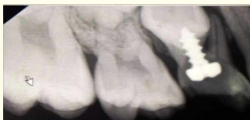
Figure 2: Radiovisiography (RVG) of #54 reveals screw pinching on crown of #24.