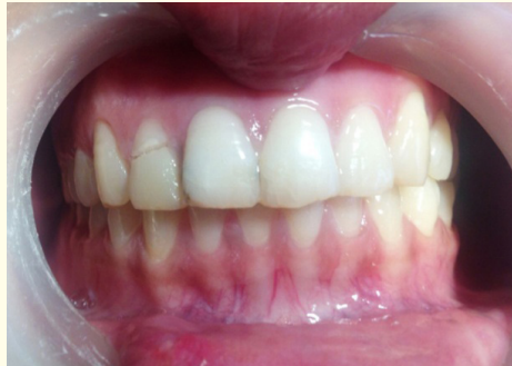
Figure 1: Pre-operative photograph.

radiographic examination it was found that there was no associated root fracture and the periapical tissue was healthy (Figure 2). As the fractured segment was available, the treatment plan decided was reattachment of the fractured segment. The treatment procedure was explained to the patient and she agreed to it.