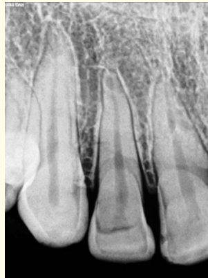
Figure 2: Pre-operative radiograph.

After administering local anesthesia, the fractured part was carefully removed and to prevent dehydration and discoloration, the original fragment was kept in distilled water till the completion of root canal treatment and post space preparation (Figure 3). Isolation was achieved using rubber dam and saliva ejector placed in position. Access opening was done and working length was determined with the help of apex locator (SmarPex, Meta Biomed) and later confirmed by radiograph. A glide path was prepared till no. 15 K files (Dentsply Maillefer, Switzerland). The biomechanical preparation was done with Protaper (Dentsply Maillefer, Switzerland) rotary file system. The last file used in the canal was F3. 2.5% sodium hypochloride and normal saline were used as irrigants. After the completion of biomechanical preparation, root canal was dried with the help of paper points (Dentsply Maillefer, Switzerland). The obturation was done with the help of F3 (Dentsply Maillefer, Switzerland) gutta-percha point using AH plus (Dentsply Maillefer, Switzerland) sealer following cold lateral compaction technique (Figure 4). After the completion of single visit root canal treatment, post space was prepared. Guttapercha filling was removed from two third of canal with the help of peeso-reamers till #4 (MANI), retaining approximately 5-6mm of gutta-percha apically. Parapost Fiber lux (Coltene Whaledent) reamer size no. 5 was used to shape the post space (Figure 5).