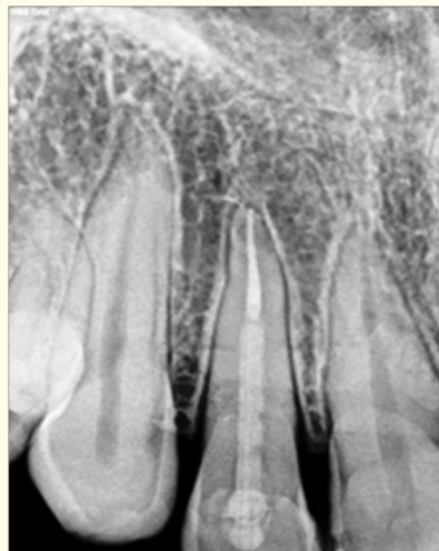
Figure 6: Post-operative radiograph.