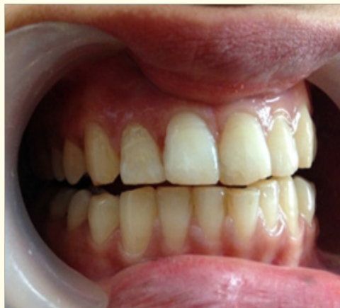
Figure 9: Follow up photograph after 2 years.