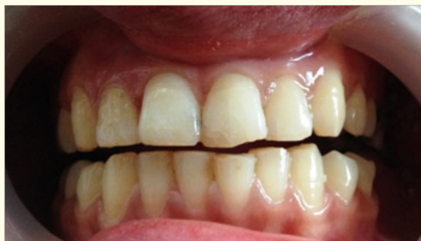
Figure 7: Post-operative photograph.