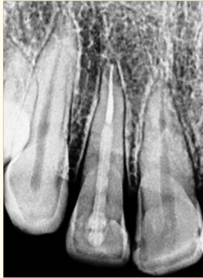
Figure 8: Follow up radiograph after 2 years.