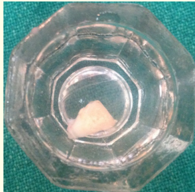
Figure 3: Fractured segment stored in normal saline