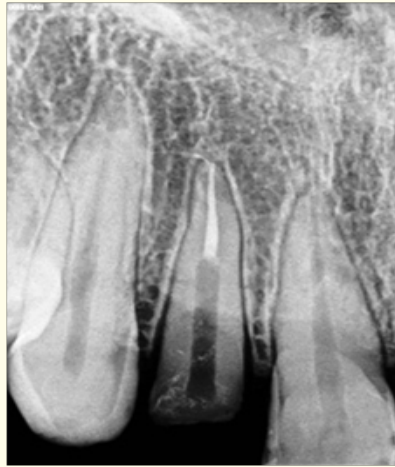
Figure 5: Post space radiograph.