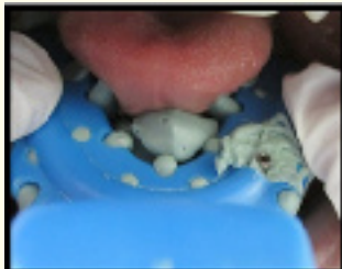
Figure 4: Pick up impression.