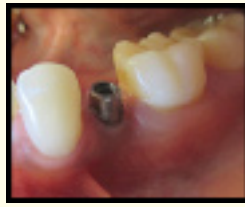
Figure 8: Abutment preparation.