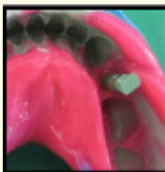
Figure 6: The implant analogue is connected to the coping.