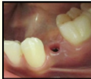
Figure 1: Management of peri implant soft tissues.

The abutment was selected and prepared according to the adjacent and opposite teeth. Final restoration, which consists on metal ceramic crown, was performed and cemented using Zinc phosphate cement.