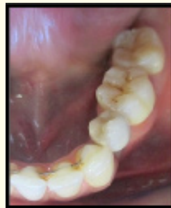
Figure 9: Final restoration; cemented metal ceramic crown with reduced buccolingually diameter.