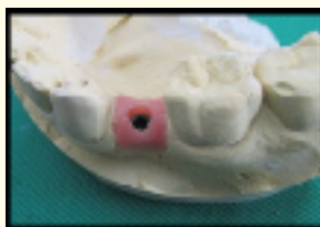
Figure 7: Working cast.