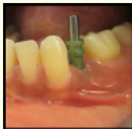
Figure 2: The coping is screwed to the implant.