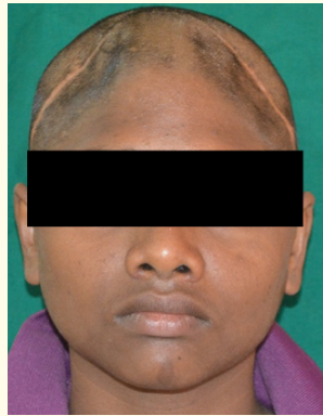
Figure 1: Preoperative frontal view.