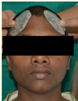
Figure 3: Trial of the PMMA implants and