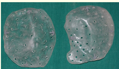
Figure 4: Incorporation of gutta percha markers for radiographic evaluation.