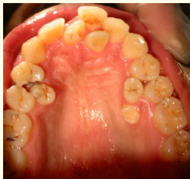
Figure 1: The maxillary arch shows right supernumerary premolar, causing carious lesion on the right premolar. On the left side, there are two supernumerary premolars. A mesiodense can be seen between the central incisor and the right lateral incisor is displaced palatally opposite the left central incisor.