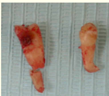
Figure 3: Extracted carious maxillary premolar on the right side together with the right supernumerary right premolar which appears with curved root.