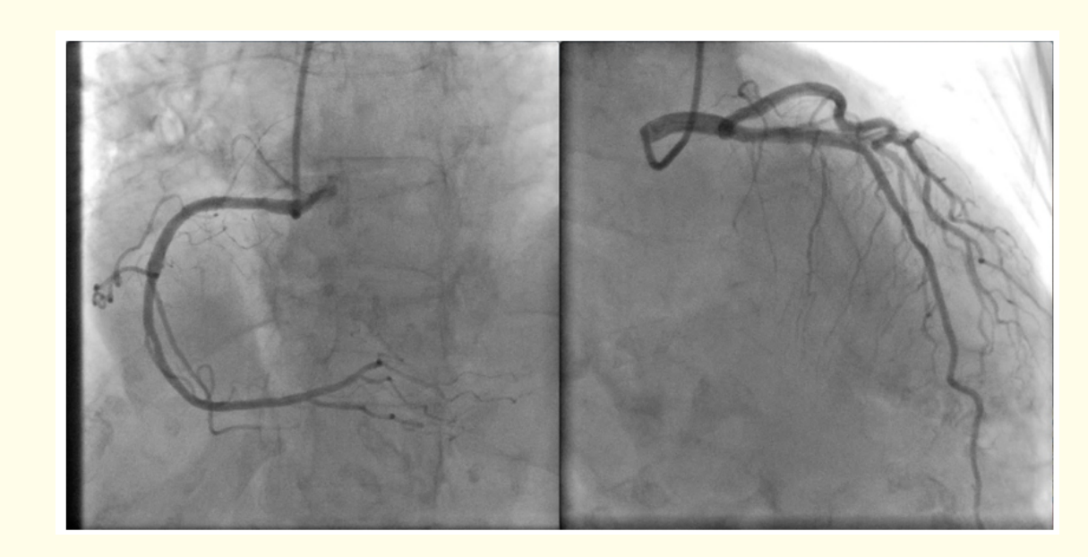
Figure 2: Left and right coronary angiogram demonstrating normal epicardial coronary arteries.

Citation: Fulvio Cacciapuoti., et al. "Hyponatremia: An Uncommon Trigger for Takotsubo Cardiomyopathy". EC Cardiology 7.2 (2020): 01-07.