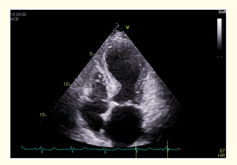
Figure 3: Transthoracic echocardiography-4-chamber view showing left ventricular dysfunction with apical hypokinesis.