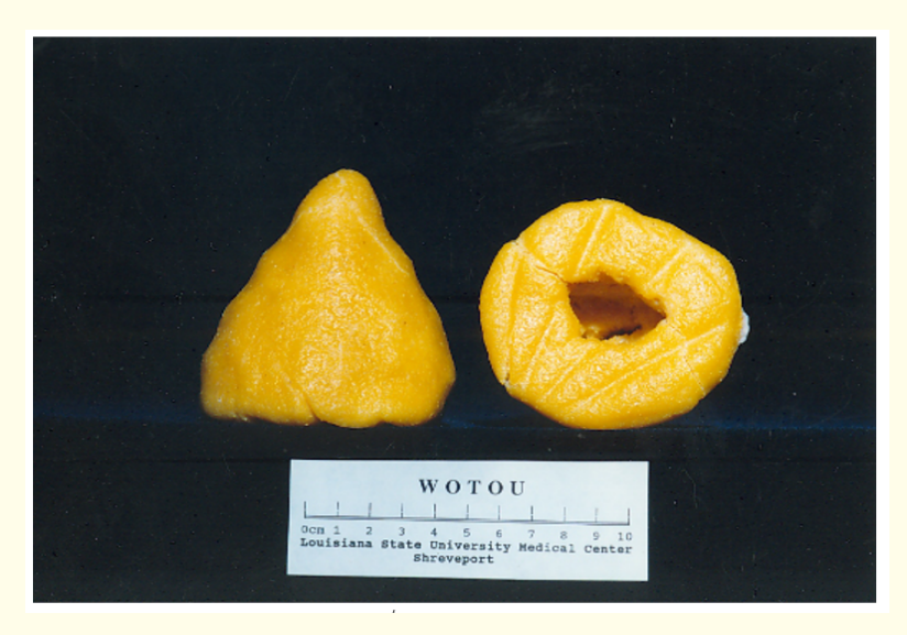
Figure 1: Wotou, a traditional regular daily food in north China.

reduced to 2/5 of their original. The laborer with daily 9 wotous received only about three pieces. Hunger sadism began nationwide. In the labor Farm, it was severe from December 1960 to May 1961 because food must be added gradually for farming. The 8<sup>th</sup> sub unit staffs quickly gathered 150 vulnerable laborers into two large thatched houses for daily medical observation. They were aged, weak, sick or disabled persons, actually candidates of famine deaths. Medicine was minimal. Practically, therapy were ordered and punctuated sleep and home made yeast liquid fermented with crude sugar extracted from beet they produced. Crude beet sugar was not classified as cereals, therefore, the director of this sub unit kindly permitted to use. This humble liquid of 100 - 200 ml a day had saved many miserable lives. From December 1960 until May 1962, 17 laborers died from this 8<sup>th</sup> sub unit, while other units without it, the deaths counted about 250 - 450 per thousand or much more.