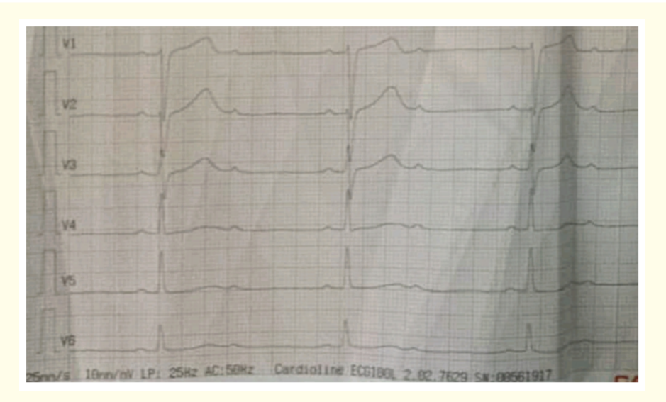
Figure 1: Precordial leads of an ECG on admission: 2:1 AV block, HR: 37 bpm, QT interval: 520ms, cQT interval: 408 ms, QRS duration: 80 ms.

12-lead electrocardiogram on admission: Regular rhythm, heart rate: 37 bpm, 2:1 AV block, normal P wave (80 ms duration and 0.1 mV amplitude), normal QRS morphology and duration (80 ms), isoelectric ST segment, normal T waves and normal corrected QT interval using Bazett formula (408 ms) (Figure 1).