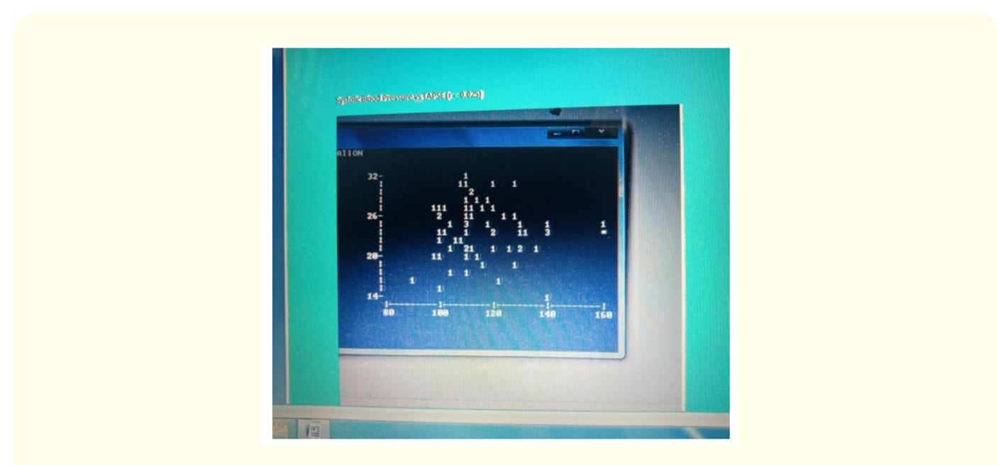
Figure 2: Correlation analysis of tapse vs peak systolic velocity (r = 0.1).

The result of comparing the mean value of Tapse in male ( 24.17 \pm 3.92 \text{ mm} ) and female ( 23.60 \pm 4.43 \text{ mm} ); shows that there was no significant difference at p < 0.05 (See table 1).