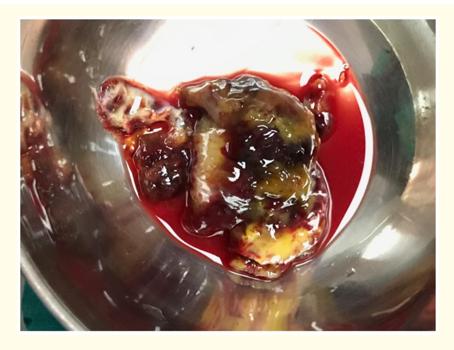
Figure 3: The myxoma after resection.