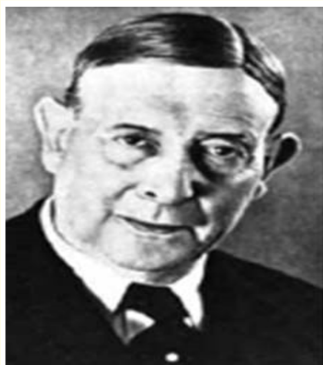
Figure 2: Dr Edgar Moniz.