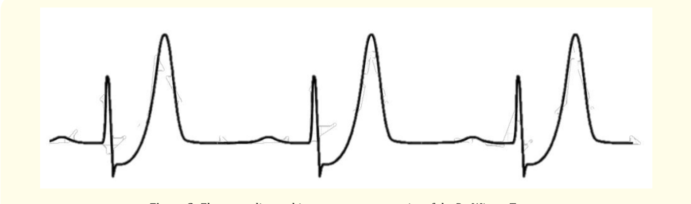
Figure 2: Electrocardiographic pattern representative of the De Winter T waves.

The De Winter ECG pattern was reported in 2008 by De Winter., et al. [12] and it's considered an anterior STEMI equivalent, meaning an acute LAD coronary artery occlusion [1,5,8,13]. This ECG pattern is characterized by a 1 - 3 mm upsloping ST-segment depression at the J point with tall and positive T-waves in precordial leads (V1-V6) (Figure 2) in most patients it's also present a ST-segment elevation at the J point of 0,5 - 1 mm in AVR, mild ST-segment depression in the inferior wall derivations and normal or slightly elongated QRS intervals [1,3,4,8,12-16].