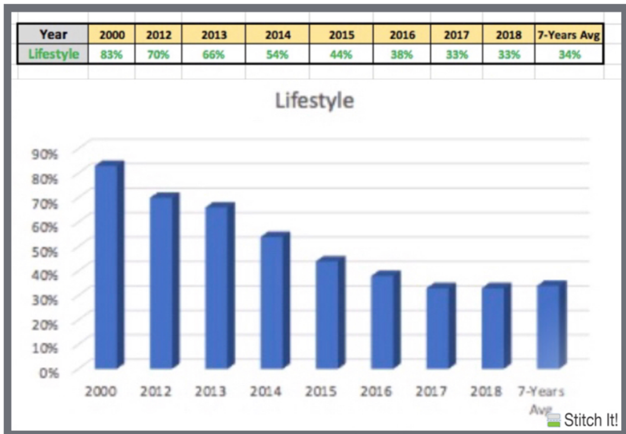
Figure 2: Significant risk probability of heart attack and stroke (lifestyle details approach).

As shown in figure 2, significant risk probability of heart attack and stroke based on medical conditions displays his calculated results of year-to-year and averaged risk probabilities based on his metabolic disorders (medical conditions):