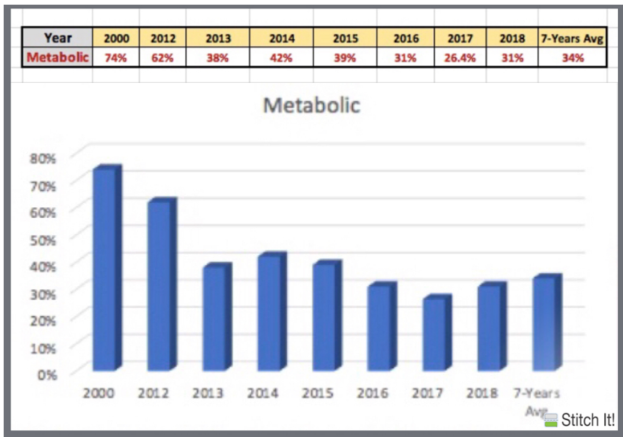
Figure 1: Significant risk probability of heart attack and stroke (medical conditions approach).

During the period of 2000 to 2012, the overall risk probabilities are in the range of 62% to 83% (an averaged risk of 74%) regardless of which approach is applied. This explains why he suffered three cardiac episodes during 2001 to 2006. The author developed the MI model and five glucose prediction tools during the period of 2014 to 2015. By 2016, he had accumulated sufficient knowledge and learned enough practical methods to improve his lifestyle and control his chronic diseases effectively. That is why all of his risk probabilities from three different approaches yield a lower risk level (26% to 38%) during the period of 2016 to 2018 (See figure 1).