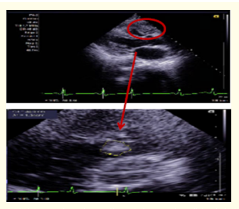
Figure 2: 2D ECHO: Large mediasenal mass infiltrates Right ventricular wall. Attached RV mass 1.4 cm.

As part of diagnostic work up, transthoracic echocardiography (TTE) was done and showed EF 40% and mobile mass in the right ventricle extended to the outflow tract. Repeated TTE confirmed impaired left and right systolic function (EF 30%), and described attached right ventricle mass and a large mediasenal mass infiltrates the right ventricle wall (Figure 2).