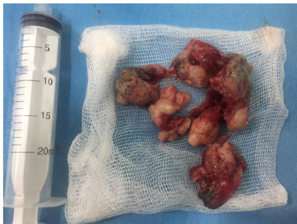
Figure 3: Image of the tumour after it was surgically removed.

The patient quickly received surgical treatment, where most of the tumor was removed through endoscopic surgery (Figure 3).