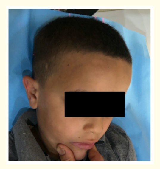
Figure 1: Coronal Computed Tomography Scan Of The Abdomen Demonstrating A Thickened And Dilated Appendix (Arrow).

A 3 year old child living in a rural area was consulting for a progressive increase in head circumference, that had been evolving for six months. Clinical examination revealed a macrocrania with a head circumference of 75 cm with no associated disorder of consciousness or deficit (Figure 1). A cerebral CT scan was performed, showing a large left frontal cyst, pushing back the cerebral parenchyma and peripheral vessels (Figure 2). The patient benefited from a cystectomy with a good evolution thereafter.