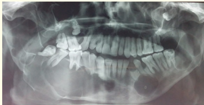
Figure 8: Tri-focal cystic image.