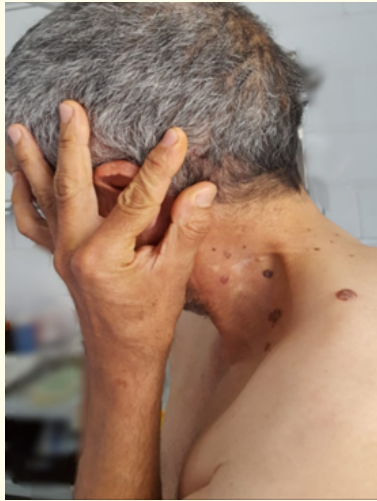
Figure 1: Cervical nevi.