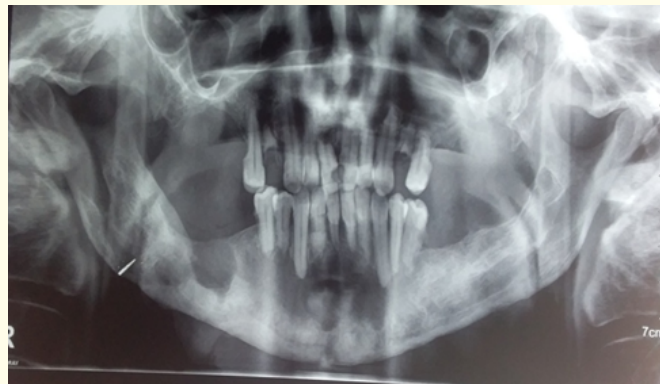
Figure 6: Mandibular cystic images.

An excision of the mandibular cyst was performed, the pathological examination was in favor of an odontogenic keratocyst.