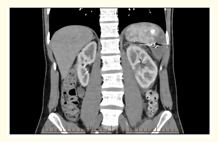
Figure 2: Post angiography computed tomography with upper pole pseudoaneurysm.

Since patient was hemodynamically stable, the injury had occurred more than 72 hours ago and there was availability of expertise to perform angiography/embolization, we proceeded to repeat angiography. Pseudoaneurysm of the upper third branch of the splenic artery was identified and coiled successfully (Figure 3). Repeat Computed Tomography on Day 2 following re- embolization suggested no new pseudoaneurysm and dissolution of the amount of hemoperitoneum and patient was discharged following the same. As per our splenic salvage protocol, on day fourteen following the embolization the patient underwent a finger prick blood test to evaluate the red cell morphology. There was no evidence of asplenia or hypo-splenism.