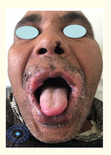
Figure 2: Destruction of the nasal septum with a scarring notch.