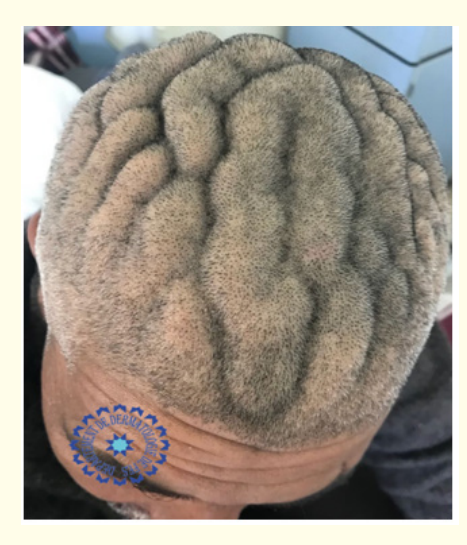
Figure 4: Scalp is covered with furrows giving a cerebral gyri appearance.