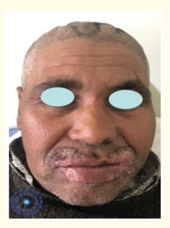
Figure 1: several perioral ulcerations with fibrinous background, topped with yellowish and hemorrhagic crusts.