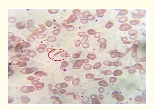
Figure 1: Peripheral blood smear showing sickle cell (Leishman stain, 1000x).

blood cells and platelets were normal in morphology. Red blood cells were microcytic hypochromic with presence of few cells appeared with tapering ends looked morphologically as sickle cells, on basis of peripheral blood finding we advised sickling test and hemoglobin electrophoresis which is confirmatory test for work up of sickle cell disease. The sickling test performed and presence of sickle cells were seen under microscope (Figure 1). Thus with presence of family history and sickle cell on smear it would reach to the diagnosis of sickle cell disease. Hemoglobin electrophoresis was done as HbF-17.7%, HbA0 1.8%, HbA2-2,5%, HbS 77.3% by high performance liquid chromatography, this pattern was consistent with homozygous state for HbS (Figure 2). Her parents were also investigated for sickling both of them were Heterozygous for HbA/S on electrophoresis thus the case was diagnosed as sickle cell disease.