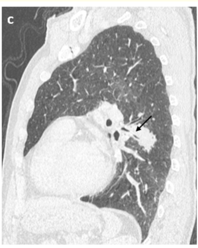
Figure 1: Thoracic computed tomography, with PDC injection, in the mediastinal window (a) and parenchymal window (b, c) showing a condensed lung mass (0) of the apical segment of the left lower lobe, with convex edges encompassing the corresponding bronchus (). Note the integrity of the mediastinal fat and the absence of lymphadenopathy (*).

Low grade B lymphoma manifests itself on imaging in the form of condensations, masses, nodules or even inhomogeneous ground glass hyperdensities with often multiple lesions [3,4].