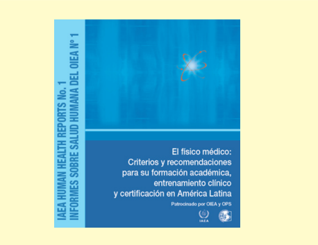
Figure 5: IAEA Human Health Reports Nº 1.

Radiosurgery should not be done without the full presence of the multidisciplinary team. In some countries some radiosurgery units considered less necessary the presence of the radiation oncologist and the selection of the dose to be administered can be found in tables, programs and textbooks, however, this does not preclude the presence of the radiation oncologist, likewise the presence of the neurosurgeon is essential, and cannot be supplemented by the fact that the radiation oncologist know placing a stereotactic frame. Currently both the neurosurgeon and radiation oncologist should know delineate and define treatment targets, despite the presence of a neuroradiologist would be ideal. All participants should know how to perform all or part the work of other members, which does not rule out the presence of anyone.