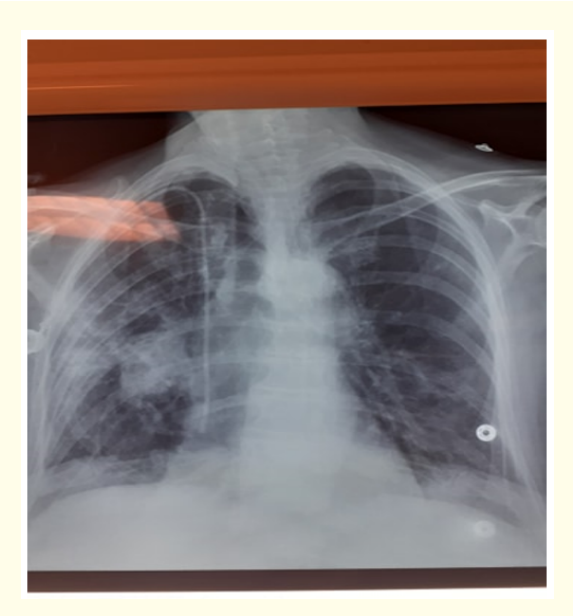
Figure 1: Chest X-ray.

MASCC score (Multinational association for supportive care in cancer) = 10 (high-risk patient). QuickSOFA = 3 (drowsiness, hypotension and polypnoea). SOFA score (Sepsis-related Organ Failure Assessment) = 9 points with mortality risk (15 to 20%). Electrocardiogram showed sinus tachycardia, with no evidence of repolarization disorder. Chest X-ray showed condensation syndrome without pleural effusion (Figure 1).