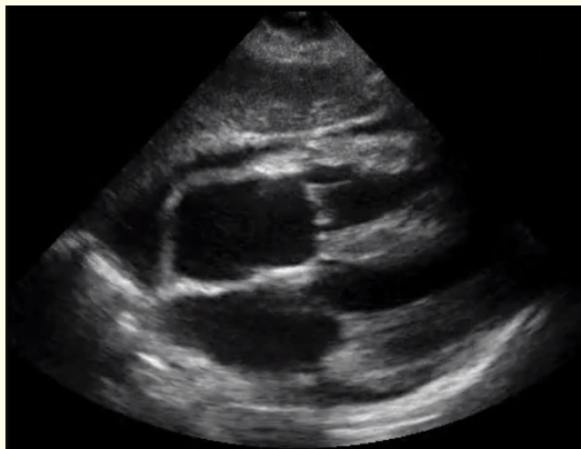
Figure 2: Apical 4 chamber view showing features of cardiac tamponade.

On D8 of admission she developed sudden hypotension (Blood Pressure 76/45 mm Hg) and was reinitiated on vasopressor support as above. An emergency 2D Echocardiogram showed a large pericardial effusion with features of cardiac tamponade (Figure 2). A bedside emergency pericardiocentesis was performed which drained 510 cc of serous straw coloured fluid which was a transudate. A pericardial drain was left in place for intermittent aspiration and 2D Echocardiogram scans were performed bedside every 4 - 6 hours.